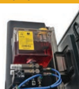
3 Mt Roller Table