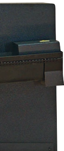
Motorized Chip Brush

Hydraulic Blade Tension Hexagonal Vices Microspray Coolant 3 Mt Roller Table Hydraulic Top Clamping 4 kW Motor