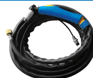
PT 31 TORCH