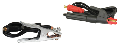
WELDING CABLE SET