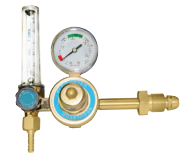
ARGON FLOWMETER EWREG0013